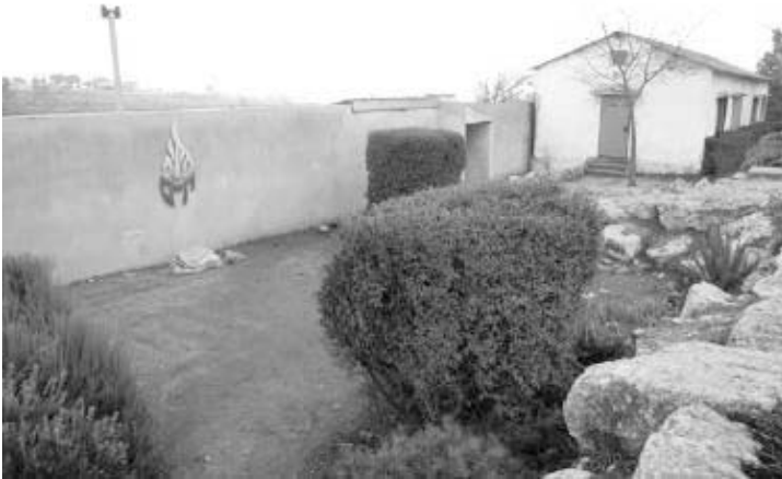
The Mekor Chaim Yeshiva high school

Everything is back to normal at Yeshivat Mekor Chayim ('Life Source'), the high school situated at the edge of Kfar Etzion headed by Rabbi Adin Even-Israel Steinsaltz. The school has been targeted, wittingly or not, by Arab terrorists twice in recent months.