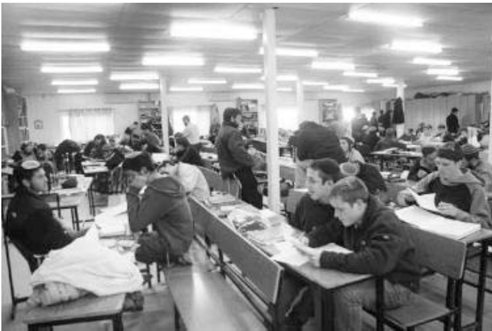
The Beit Midrash (Study Hall) at Mekor Chayim.