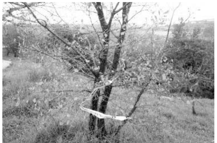
Police tape flutters from the trees near the scene of the attack.

“It was truly miraculous that nobody was killed in this attack,” he says. “It could have ended so much worse.”