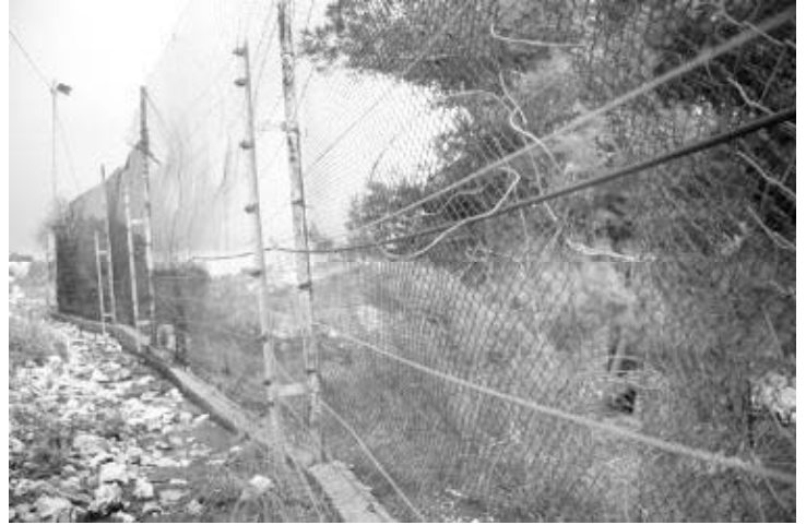
The terrorists cut through and disarmed the electric fence.

The terrorists cut the electric fence, and made their way up the hill toward the yeshiva along dirt-paths through the 40-year-old forest.