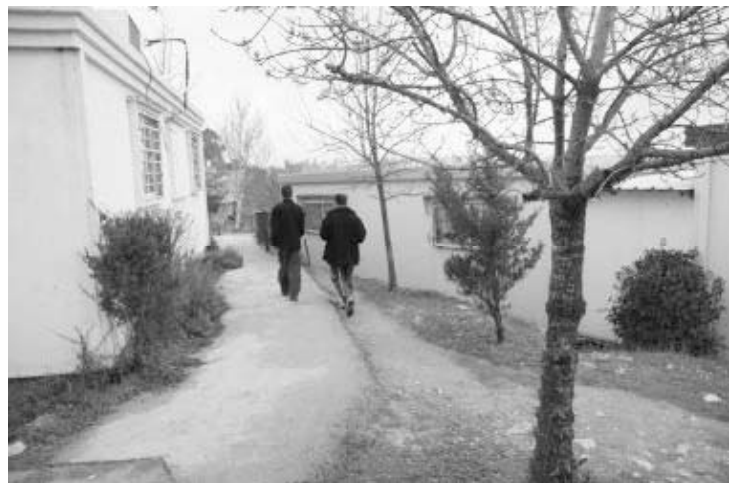
Students walking between the pre-fab structures that house the various classrooms and facilities.

Life at Mekor Chayim continued without missing a beat. Students begin classes at 7 AM with morning prayers and classes last until 8:30 or 9:30 at night. Rabbi Zekbach says the guiding philosophy of the school is that high school must not be a place of simply working and preparing for future educational pursuits, but a place of maturation, exploration and specialization. “Students take part in decision-making committees and are also encouraged to take part in extra-curricular activities from drama to music to hiking,” he explains.