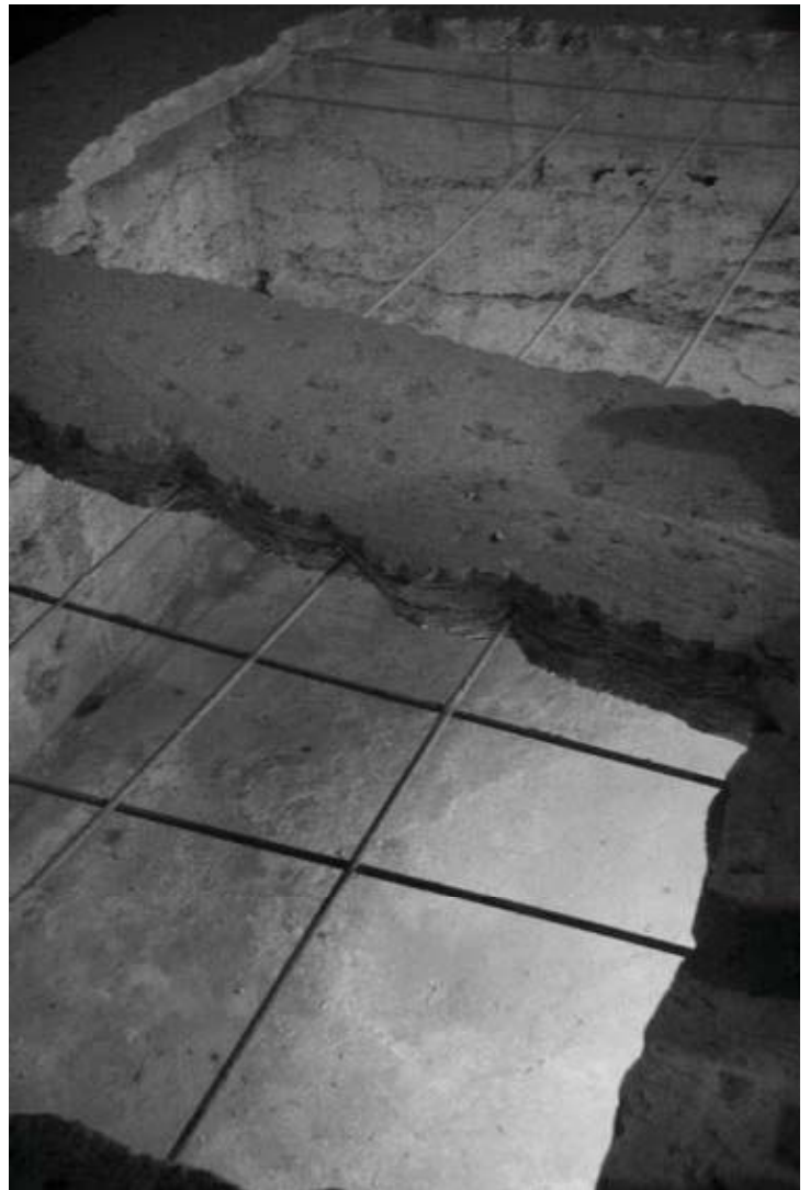
The bunker where Kfar Etzion's original residents were slaughtered by Arab attackers.