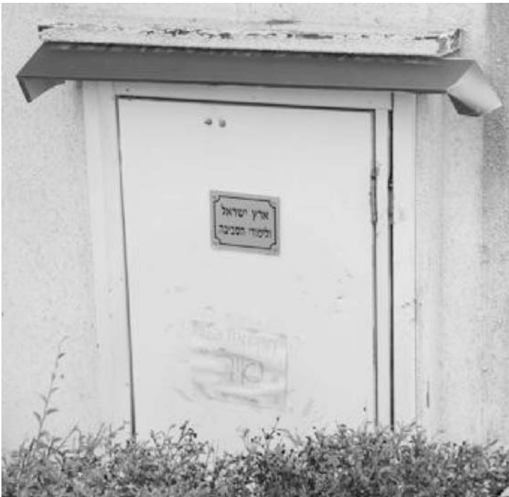
"Land of Israel and Environmental Studies" classroom at Mekor Chaim.