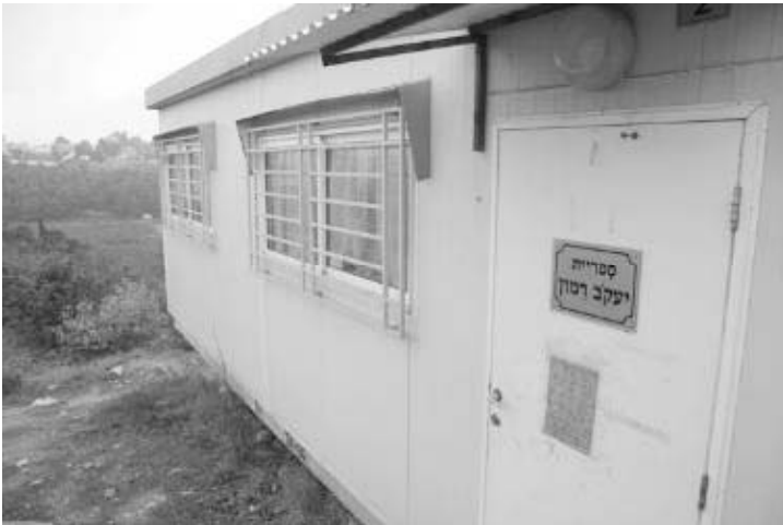
The library where the attack occurred.