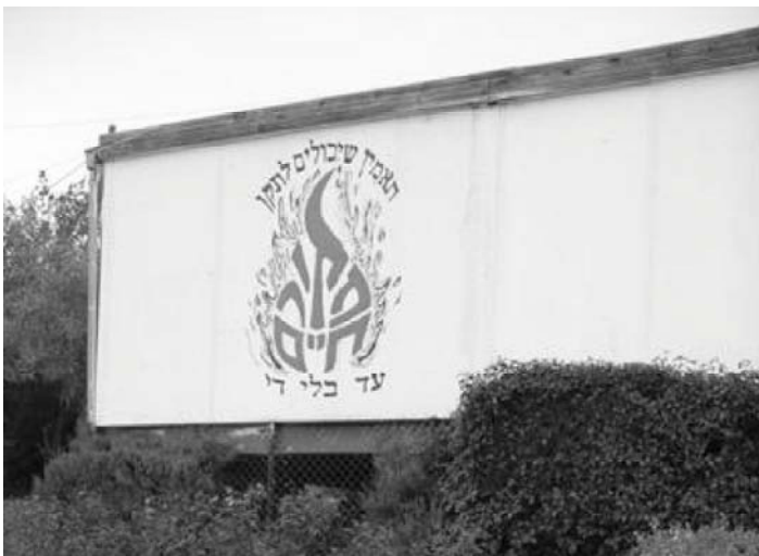
"Believe that we can rectify without limits!" reads a mural on one of the dorm rooms.