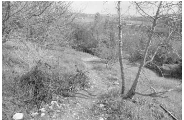
The path used by the terrorists up from the orchards toward the school

Walking those paths, one clearly hears the din of hundreds of students engaging in chavruta (paired) study of Jewish texts in the Beit Midrash (the study hall set aside for Torah discourse and exposition), with its large windows facing outward.