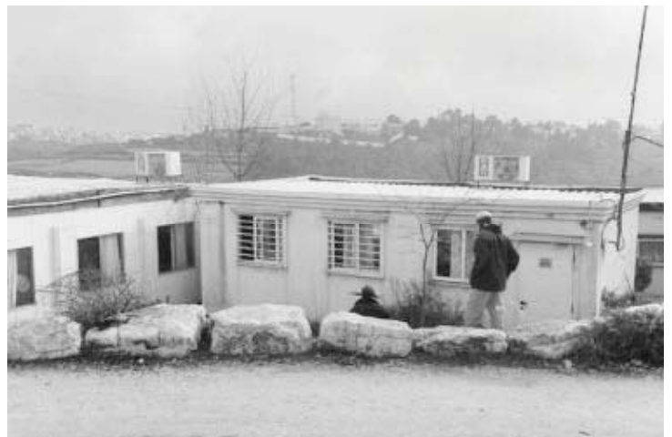
The Gush Etzion IDF army base can be seen in the distance across the valley from the school.

"These are the sons of those who have returned. Many were born here and they are studying here in a way that fills them with the fire of the Torah and encourages them to use that fire to bring out the wisdom of the Torah in everything from rock climbing to raising goats. These are the mighty future leaders of Israel and no cowardly terrorist can stand up to that."